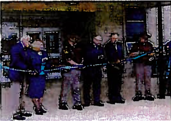
Ribbon Cutting ceremony featured dignitaries from across the country.