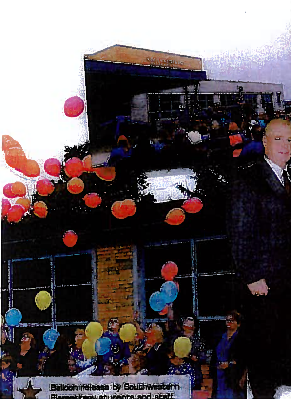
Balloon release by Southwestern Elementary students and staff.