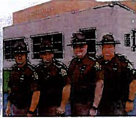
The Shelby County Sheriff's Office was instrumental in the implementation and completion of the Best Practice Solution System.