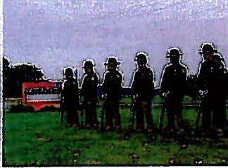
ISA Color Guard prepares for salute during the ceremonies.